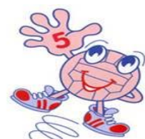
High 5 Netball